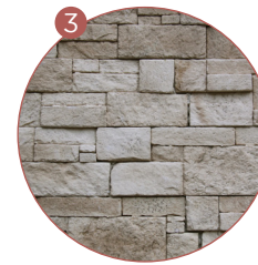
3 | apply the water-repellent

Layout = Way of arranging the facing stone elements to obtain a harmonious whole.