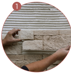
1 | install