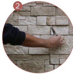
2 remove any excess adhesive