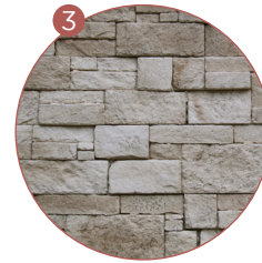
3 apply the water-repellent

Layout = Way of arranging the facing stone elements to obtain a harmonious whole.