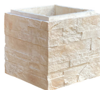
PORTLAND pilaster element L. 37 x l. 37 x H. 33 cm